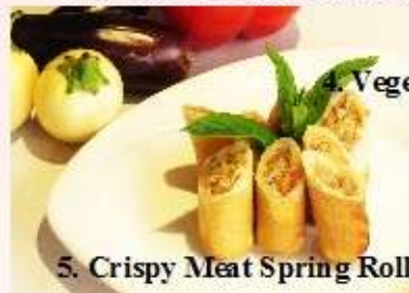
4. Vegetarian Spring Roll (4) £3.60

Minimum for 2 persons £6.00 per person Satay Veg Skewer Spring Roll Dumplings Salt & Pepper Tofu Seaweed